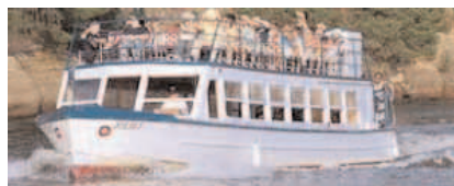
Upper Dells boat tour on the Wisconsin River.