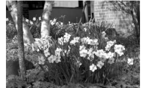
St. Luke's gardens

Contributions will be long lasting throughout the year and years to come.