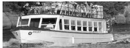
Upper Dells boat tour on the Wisconsin River.

Registration: At the Information Center (We must have a minimum of 20 participants)