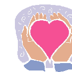
IHN - THE ROAD HOME